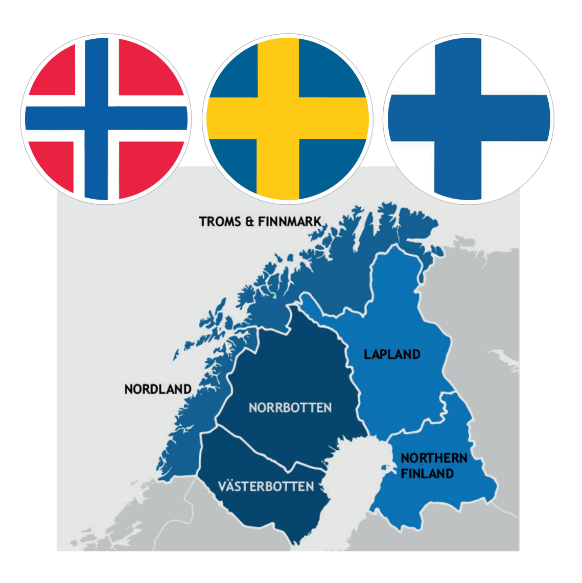
High North Cooperation (HNC) Report 2024